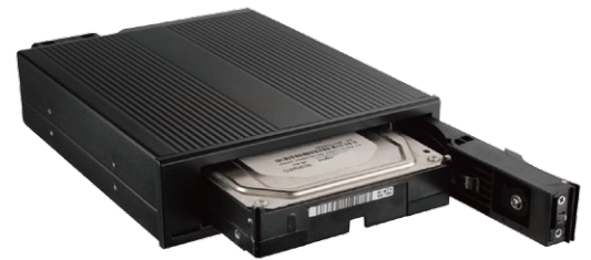
Easy drive plug-in and ejection mechanism