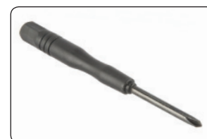
Screw driver included