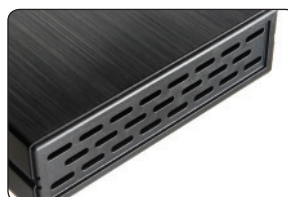
Front air vents