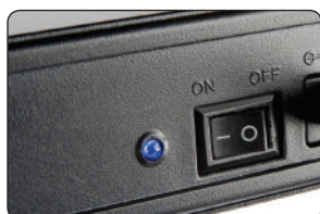
On/Off power switch and dual-mode status indicator (Power/Access)